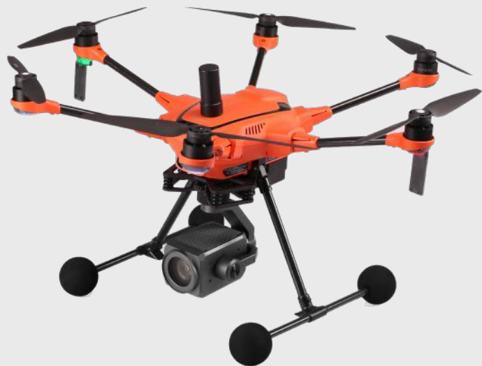
Camera not included.